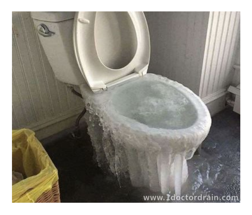
Trust Doctor Drain for All Your Toilet Repair Needs

Older toilets may be more prone to issues like buildup, inefficient flushing, and part wear. Upgrading to a newer model from a reputable brand like Kohler, Toto, or American Standard can enhance performance and reduce water usage, making it a worthwhile investment.